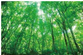
World Heritage Site Shirakami- Sanchi