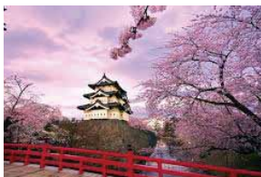
Hirosaki Cherry Blossoms